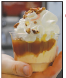
ORANGE CRUSH 22CM editors find best pumpkin treats on the North Shore, Page 26

PRETTY IN PINK Northbrook Theatre presents 'Pinkalicious' on stage, Page 27